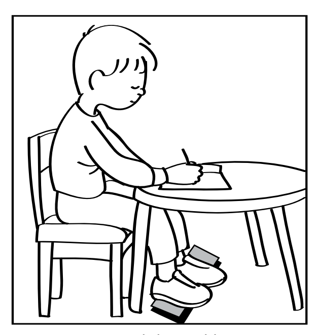
Correct sitting position Note: feet should not be dangling